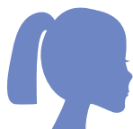
GOAL 2 INTELLECTUAL VALUES