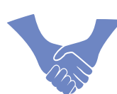
GOAL 4 BUILDING COMMUNITY