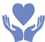
GOAL 1 ACTIVE FAITH